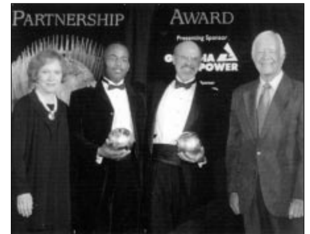
Former President Jimmy and Rosalynn Carter (here pictured with Georgia's 2002 awardees) will present the Jimmy and Rosalynn Carter Partnership Award on February 21, 2004 at the University of St. Thomas.